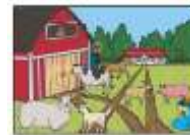
at the farm.