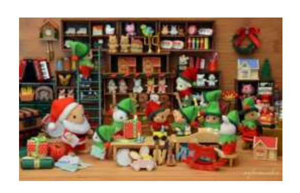
We will create Christmas themed crafts!